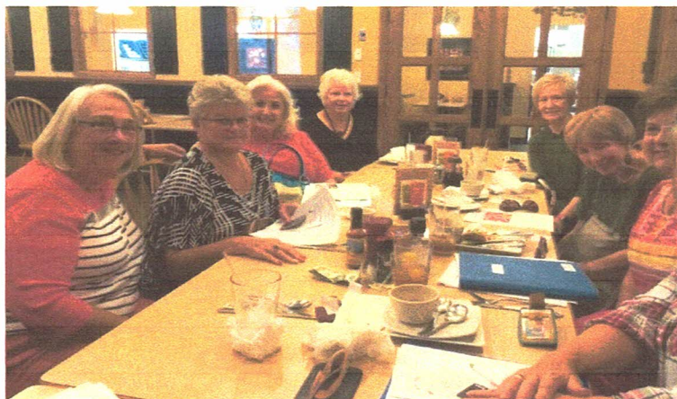
“Spring Fling” committee members are planning for March 3 event.